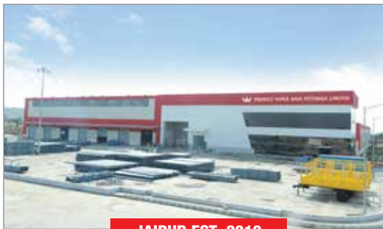
JAIPUR EST. 2019