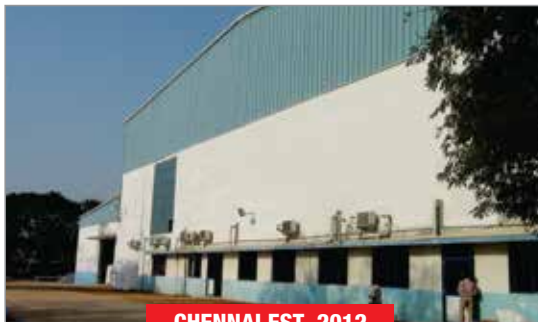
CHENNAI EST. 2012