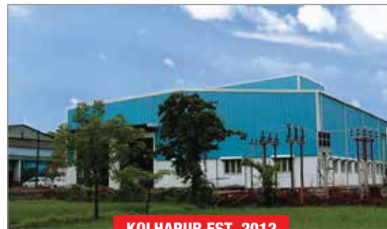
KOLHAPUR EST. 2012