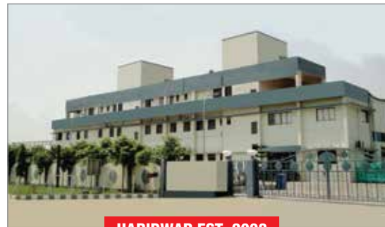
HARIDWAR EST. 2008