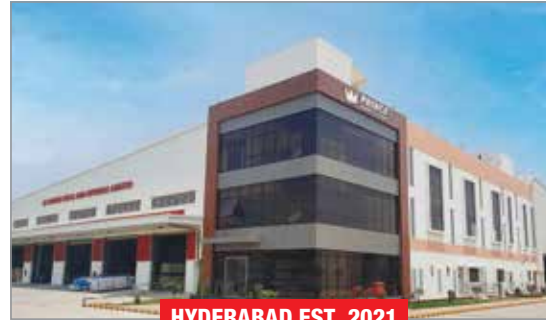
HYDERABAD EST. 2021